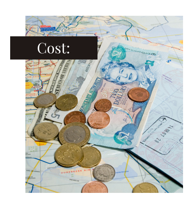
$800.00 to EHC + Airfare

Upon turning in your funds Zeal will distribute your funds and purchase your tickets