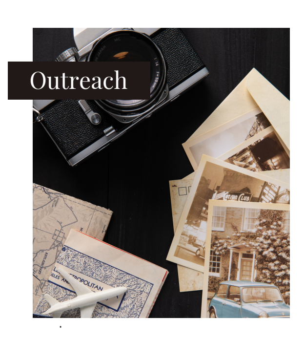
Home to Home visitations

Upon turning in your funds Zeal will distribute your funds and purchase your tickets