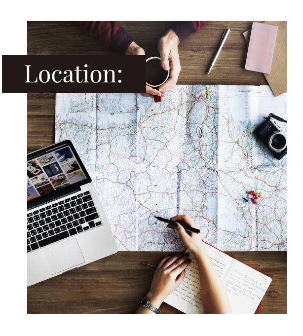
Trinidad and Tobago